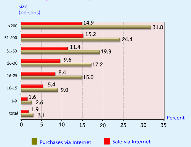
Figure 5 Percentage of Establishments purchasing and selling via Internet by Economic Activity

The results of the survey showed that there was a small proportion (3.1 percent) of establishments purchasing via internet and about 1.9 percent selling via internet. (Figure 5)