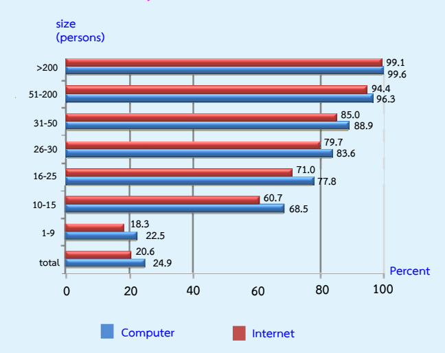
Figure 2 Percentage of Establishments Using Computer and Internet by Size of Establishment

The highest proportion of using computer and internet engaged in private hospital activities. The lowest proportion engaged in activities of Manufacturing. (Figure 3)